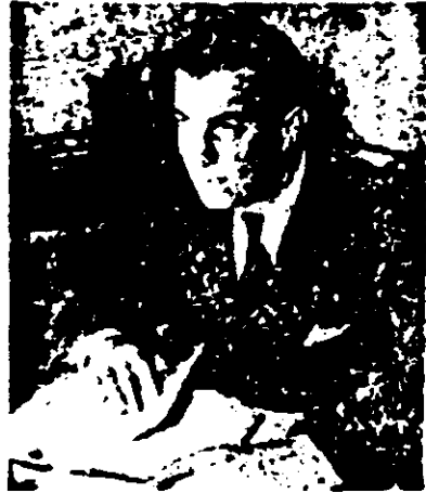
FRANKLIN D. JR. Left and anti-Red